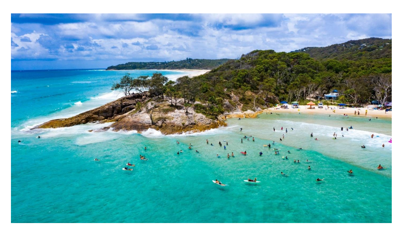
Sponsorship & Exhibitor Prospectus ICCB 2025

ICCB maintains an up-to-date congress website <a href="https://conbio.org/conferences/iccb-2025/">https://conbio.org/conferences/iccb-2025/</a> and actively engages with the conservation community through ICCB's established social media accounts. Regular updates will be provided in the lead-up to, during, and after the congress, ensuring that the global conservation community remains well-informed about the latest developments at the world's largest conference on conservation biology.